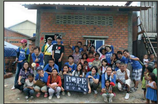
HOPE worldwide Taiwan team with Home Care Team

After a site visit with SHCH's Home Care Team, HOPE worldwide Taiwan and representatives from the Harmony Home Association of Taiwan saw the needs of poor HIV people living in urban slums and rural communities around Phnom Penh. With a generous gift of $36,000, Harmony Home Association of Taiwan is a committed supporter in 2015.