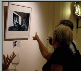
100 people attended the reception