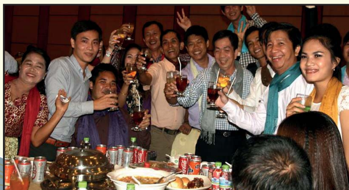
-- Happy time at the party

Every year, nearly 500 staff from SHCH and the HOPE worldwide Medical Centers—gather to celebrate the new year. With the generous support of business partners, we were able to contribute gifts for the Lucky Draw and provide refreshments. These gestures really support the work of people who are serving the poor with compassion, kindness, respect and integrity.