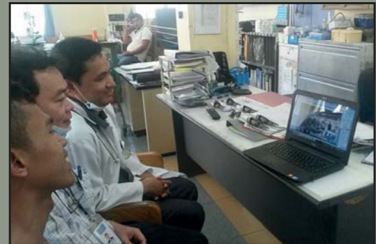
SHCH team have skype conversation with Hoops for HOPE in US

Our medical and communications teams cheered on the dedicated players who are playing a 24-hour basketball marathon for Boston's Hoops for HOPE at midnight their time Saturday morning for us.