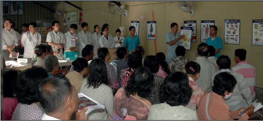
The Diabetes Support Group provides education to patients every two months at CMC.

SHCH recently received a $100,000/2year commitment to improve diabetes care at HOPE worldwide Medical Centers and SHCH. The funding will develop a robust diabetes management program focused on collecting baseline data on new patients, enhancing patient education programs and developing a data collection system that will better measure outcomes over time. The funding supports a dedicated project coordinator in addition to providing support for coordinated efforts by the medical teams at SHCH, HOPE worldwide Medical Centers and Sonja Kill Memorial Hospital.