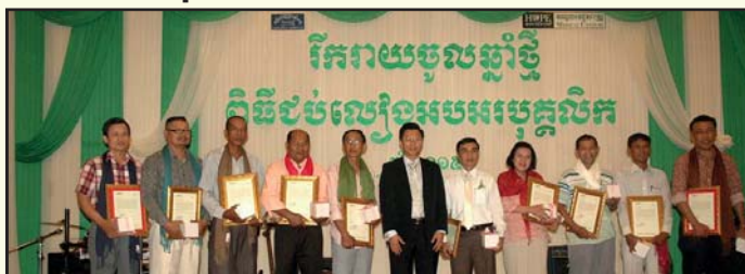
Congratulations to the staff celebrating their 15-year of service to SHCH

Every year, nearly 500 staff from SHCH and the HOPE worldwide Medical Centers—gather to celebrate the new year. With the generous support of business partners, we were able to contribute gifts for the Lucky Draw and provide refreshments. These gestures really support the work of people who are serving the poor with compassion, kindness, respect and integrity.