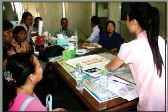
Breast Cancer peer educators activities

SHCH's Breast Cancer program was established in 2008. It provides free treatment to poor Cambodian women. The program also support peer educators to target villages for education. Every month, they meet to share experience.