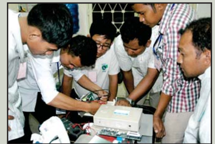
BMET trainees practice in SHCH's maintenance shop

For Cambodia's BMET program, SHCH has emerged as a ready partner to support the practical application of theory. “We've been using SHCH's workshop regularly during the practical session. SHCH's staff are responsive, supportive and empowered to facilitate a great learning experience for this cohort. Overall, we are seeing great successes this year with the expansion of students. There is a lot of informal networking and information sharing occurring, and a strong emergence of critical thinking and ownership among the students. The collaborative and solution-oriented approach that SHCH brings is a key part of the building momentum of the Biomedical Technician training program in Cambodia.”